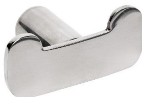
AI2318C Bright finish