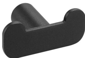
AI2318B Black finish