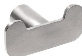
AI2318CS Satin finish